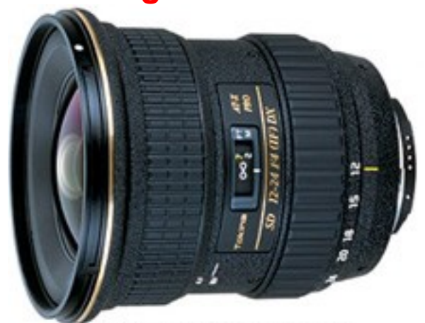
TOKINA AT-X 124 AF PRO DX (AF 12–24mm f/4)

Lenses with a wide angle of view have become standard as kit-lenses on most low-end D-SLR cameras on the market, always as zoom lenses. These lenses are great for landscapes , architecture and indoor photography — but be aware of the distortion they create. The closer you are to your object the more distorted it will become, and the distortion is most predominant in the corners.