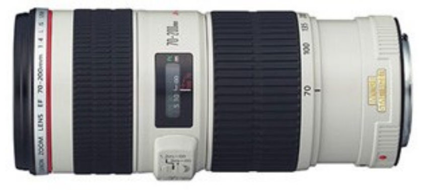
CANON EF 70-200mm f/4L IS USM