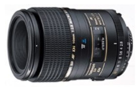
TAMRON SP AF90mm F/2.8 Di Macro Lens 1:1

Macro photography is close-up photography .