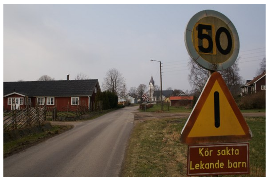
18mm, Wide Angle