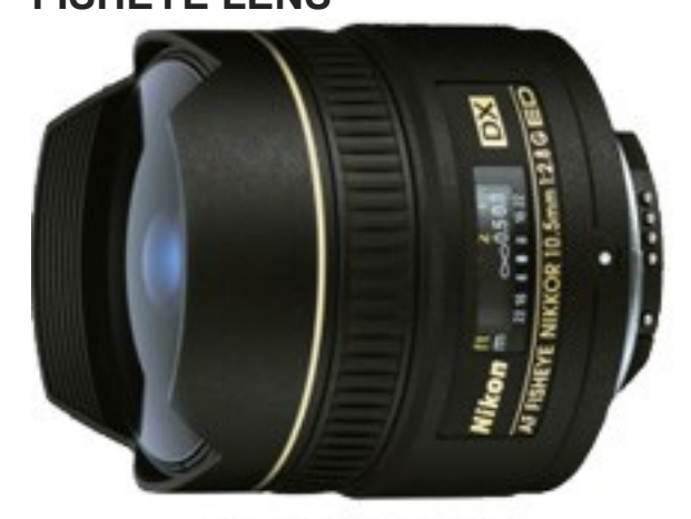
NIKON AF DX Fisheye NIKKOR 10.5mm t/2.8G ED Fisheye lenses are extreme wide-angle lenses, having a 180° horizontal angle of view. There are both Circular and Full-frame fisheye lenses, the circular will create a round image in the center with unexposed (black) edges and the full-frame lens will fill the entire sensor but will only have 180° horizontal and not vertical.