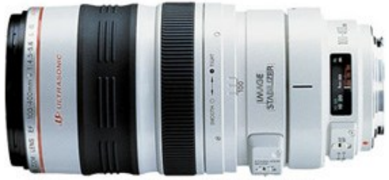
ZOOM EF 100-400mm f/4.5-5.6L IS USM